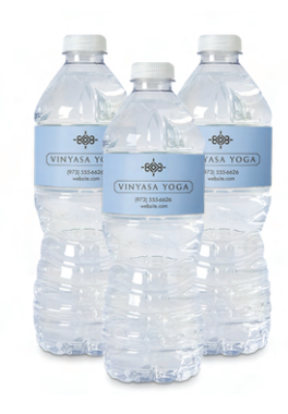
Water Bottle Labels

Be ready to make a connection, wherever you are.